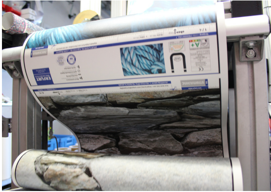
The customised production of wallcoverings – as here in toner printing – delivers excellent results on the wall.