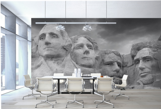
Almost every visual design request can be achieved using high-quality Erfurt digitally printed wallcoverings.

Wuppertal, December 2017 – (fpr) Whether in terms of work, social interactions or consumer behaviour: nothing better describes the desire of the individual for self-expression and independence as well as the current mega-trends for „customisation“ and „personalisation“. A huge range of consumer goods and innovations are offering a wealth of possibilities in