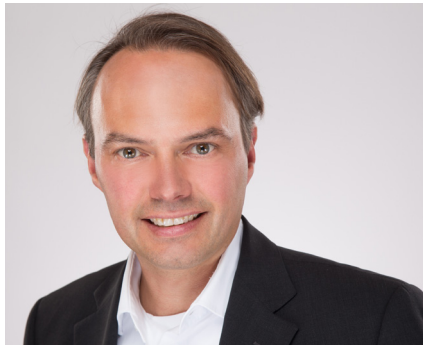
According to Frank Seemann: „Erfurt supports professionals and customers in making their individual wall concepts a reality.“

These wallcoverings, printed in brilliant sharpness, are cut pixel-precisely in a preliminary printing stage and production process, which ensures the exact application of individual lengths of wallpaper to the wall – both with detailed images as well as when covering larger image areas. The various textures perfectly translate the effect of the image and pattern etc., giving the images additional dimensionality and depth. And thanks to their high-quality material properties, Erfurt products also offer customers a wealth of relevant benefits. Digitalvlies nonwoven wallcoverings are durable and made of special cellulose and textile fibres with a finish pre-coated for digital printing. The final wall image also remains beautiful in the long term, as it is also dimensionally stable and covers cracks. And, last but not least, Erfurt also provides the best base surface in terms of health, as the wallcoverings are free of PVC, plasticisers and solvents harmful to health.